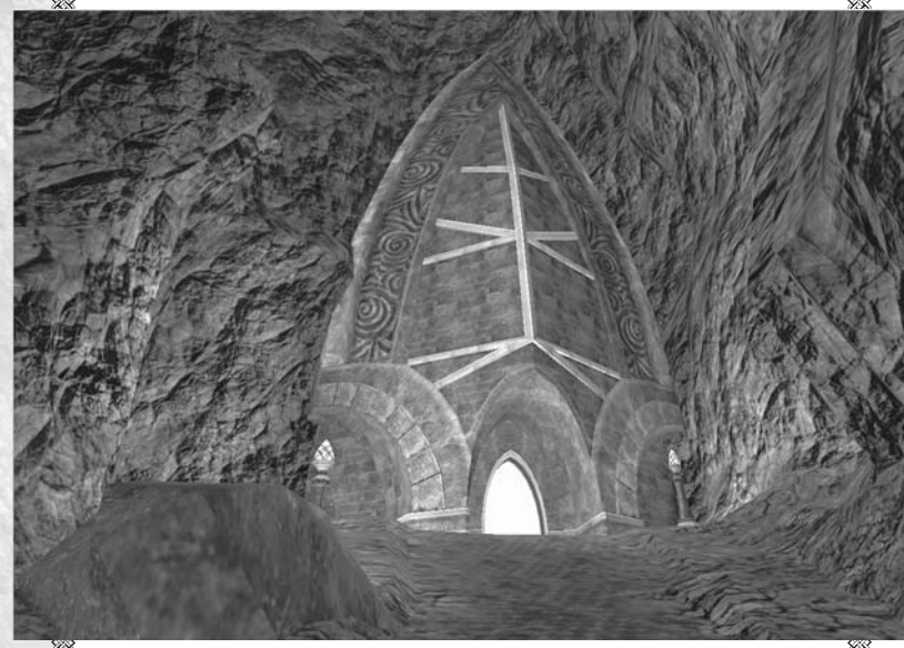
The Shar Labyrinth

Using the magic obtained from their time in The Veil, the Shar half-grew, half-built a magnificent labyrinth of a city fit to be their seat of power.