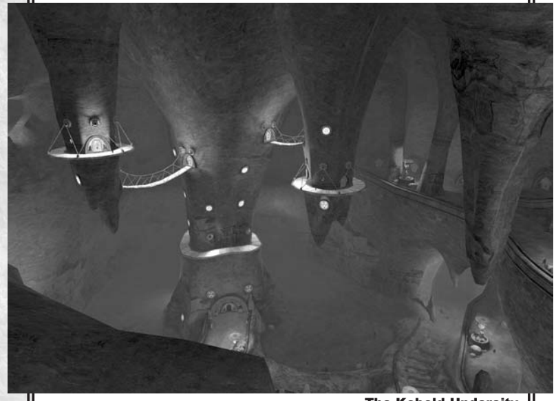
The Kobold Undercity

Built in the same series of caves that gave birth to the Burial Grounds, The Kobold undercity remained a secret from the surface for thousands of years.